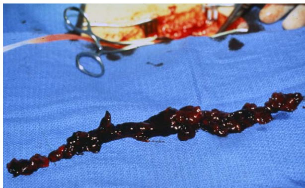
Figure 3. Operative photograph of thrombus retrieved from a patient with phlegmasia cerulea dolens after surgical iliofemoral venous thrombectomy.