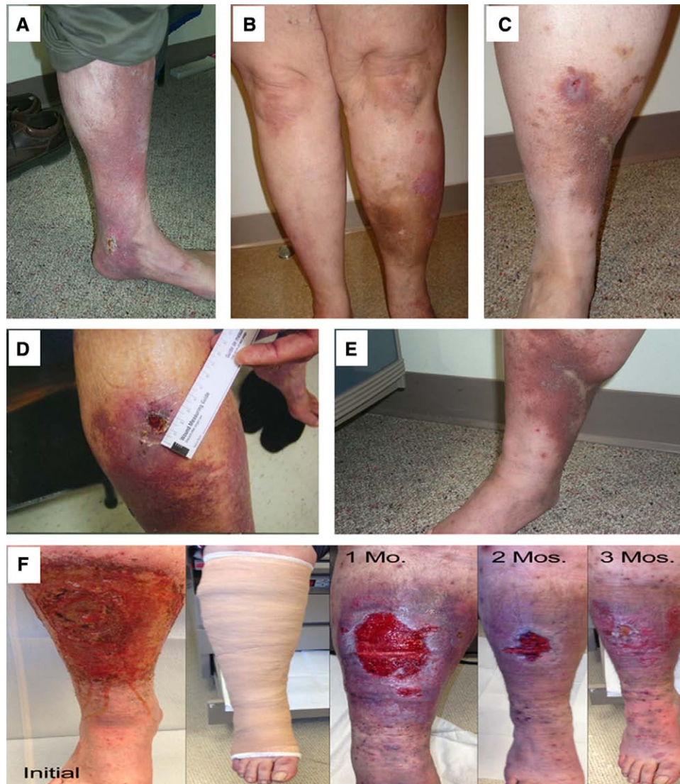
Figure 4. Various degrees of postthrombotic venous ulcers. A , Healing ulcer, medial malleolus of left leg required. B , Healed venous ulcer (this patient also has psoriasis, accounting for reddish skin abnormality on the lateral portion of anterior calf). C , A 30-year-old woman with severe postthrombotic syndrome of the right lower extremity, demonstrating a small, round, open, weeping ulcer, along with pronounced subcutaneous fibrosis. Reprinted from Nayak et al 117 with permission from SIR. Copyright © 2012, SIR. Published by Elsevier Inc. D , Round, open, active ulcer of ≈1-in diameter. E , Large healed ulcer with pronounced subcutaneous fibrosis and resulting deformity in skin architecture. F , Patient with advanced postthrombotic morbidity who suffered from iliofemoral and vena caval occlusion. This patient presented with a large venous ulcer of the right lower extremity. Sequential photographs at 1, 2, and 3 months show the progressive benefit of sustained multilayer compression for the management of venous leg ulcers. Photographs in A , B , D , and E are courtesy of Dr Vedantham. Photograph in F is courtesy of Dr Comerota.

As a first principle, detection and elimination of iliac vein obstruction may be worth considering for patients with moderate to severe PTS. Below, we describe the endovascular and surgical means to do this. An important consideration when evaluating procedural results is that there often is uncorrected disease distal to the most proximal reconstruction, which will mitigate the clinical response to the procedure. Interventions to correct reflux might be considered in a highly symptomatic patient once it is known that the iliac vein is open.