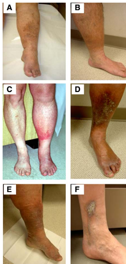
Figure 1. Clinical manifestations and spectrum of postthrombotic syndrome (PTS). A and B , Edema and hyperpigmentation. C , PTS 3 months after the onset of iliofemoral deep venous thrombosis (DVT; treated with anticoagulation alone). The patient has venous claudication, swelling, bluish discoloration, and pigment changes of the left lower extremity. CEAP (clinical, etiological, anatomic, pathophysiological) classification is C4a. His Villalta score is 16. D , Lower extremity of a patient with PTS 6 years after acute DVT showing edema, hyperpigmentation, and lipodermatosclerosis. His CEAP classification is C4b and Villalta score is 15. E , Edema, redness, hyperpigmentation, and lipodermatosclerosis. F , Hyperpigmentation and a healed venous ulcer.

PTS, a form of secondary venous insufficiency, is characterized by a range of symptoms and signs (Table 2). Typical symptoms of lower-extremity PTS include pain, swelling, heaviness, fatigue, itching, and cramping (often at night) in the affected limb (upper-extremity PTS is discussed later in Upper-Extremity PTS). Symptoms differ from patient to patient, may be intermittent or persistent, usually worsen by the end of the day or with prolonged standing or walking, and improve with rest or limb elevation. Venous symptoms associated with the initial DVT can persist for several months and may transition to chronic symptoms without a symptom-free period. 8 PTS may also present as venous claudication, likely caused by persistent