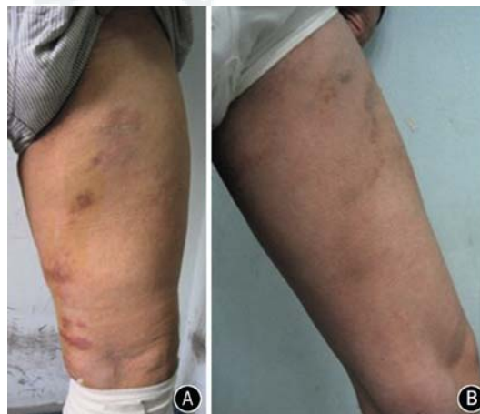
Figure 2. Ecchymosis on lower extremity after EVLA procedure. A: Three days postoperation. B: Seven days postoperation.

Hematoma in the GSV tunnel was observed in five patients (16.1%), with small ecchymosis (Figure 2). It was considered that these hemorrhagic areas were closely related to the punctured sites of tumescent infusion or laser ablation. Other side effects, such as induration and medial malleolus edema over the treated vein were quite common in the early post-ablation period, but self-limited during the first month following EVLA. No signs of neurologic lesion on the saphenous nerve were observed. No major complications, such as skin burns, deep vein thrombosis, or pulmonary embolism, occurred. The results of 1, 12, and 18 months after therapy brought to the satisfied occlusion rate of 92%, 94%, and 94%, respectively (Figure 3).